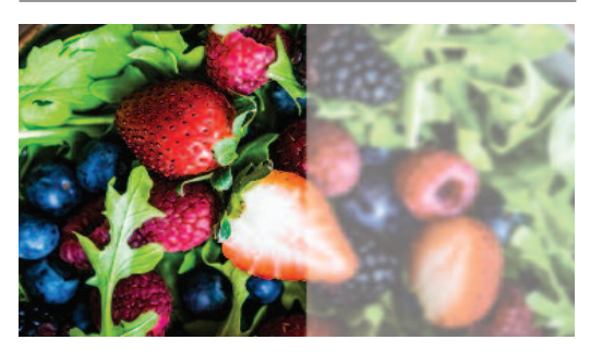
Viewed through material with low haze